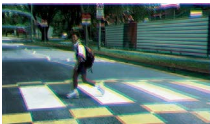
A blurry view of a crosswalk

Idaho requires a minimum visual acuity of 20/40 in at least one eye, with or without corrective lenses. A person with 20/40 vision must be twice as close to an object to see it as clearly as a person with 20/20 vision. If you need corrective lenses to pass the vision screening test a lens restriction will be placed on your driver’s license and you must always wear those corrective lenses while driving.